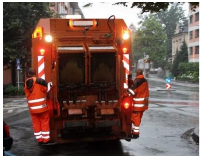
Picture left: Thermal Waste Treatment Plant in Kaunas, Lithuania; picture top right: waste fire; picture bottom right: refuse collector.